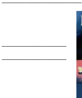
( 'Coup de gigot' )