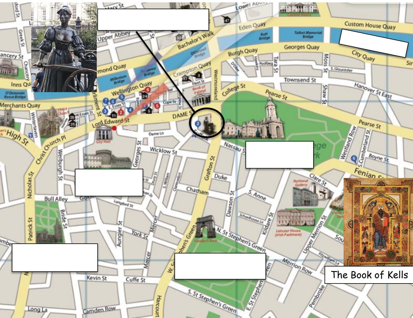
The Book of Kells

Opposite Trinity College, we can see the statue of Molly Malone in Grafton Street. She is a mythical figure from a famous Irish song. If you like castles and churches, we can go to Dublin Castle and St Patrick's Church in the south west of the city. Finally, let's have a walk along River Liffey if it's sunny!